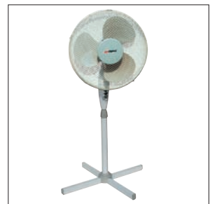
Ventilator cu picior EUR 7.00 Cod 025.010.500.020