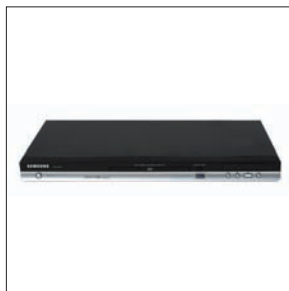
DVD Player EUR 40.00 Cod 025.010.130.030