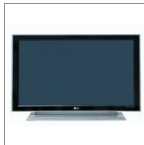
TV Plasma EUR 25.00/zi Cod 025.010.130.040