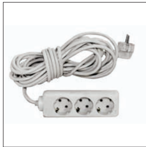
Prelungitor 230V, 10A, 5m EUR 10.00 Cod 019.010.279.000