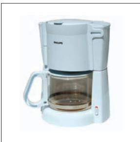
Filtru de cafea EUR 4.00 Cod 025.010.120.010