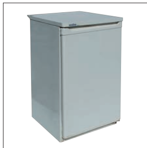
Frigider ARCTIC (180 l) EUR 44.00 Cod 025.010.070.020