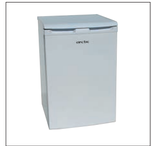
Racitor (140 l) EUR 24.00 Cod 025.010.070.010 (55 x 61 x 84 cm)