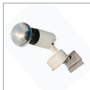
Lampa spot SS30 100W EUR 12.00 Cod 019.010.200.008