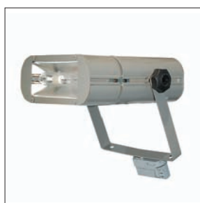
Reflector IVEN HQI 150W EUR 35.00 Cod 019.010.200.005