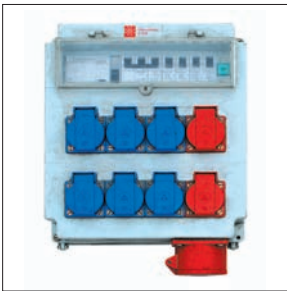
Panou Electric OCTANORM EUR 120.00 Cod 019.010.275.000