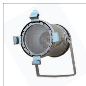
Reflector HIGHLITE HQI 150W EUR 35.00 Cod 019.010.390.000