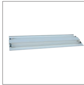
Corp fluorescent tip OCTANORM EUR 20.00 cu doua tuburi D-171 Cod 019.010.200.000