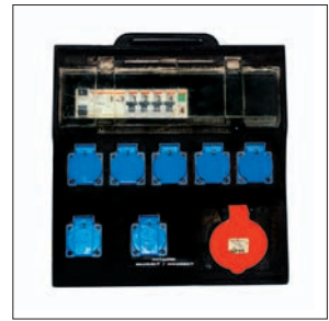
Panou Electric 380V/220V EUR 100.00 Cod 019.010.265.000