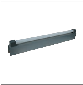
Corp fluorescent tip SS30 EUR 15.00 cu un tub D-170 Cod 019.010.190.000