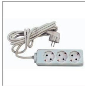
Prelungitor 230V, 10A, 3m EUR 10.00 Cod 019.010.277.000