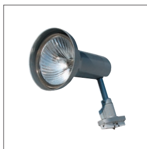
Spot halogen SY STAR 100W EUR 15.00 Cod 019.010.185.000