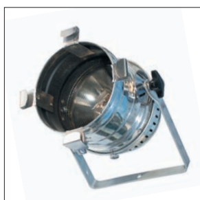
Reflector PAR64 500-1000W EUR 40.00 Cod 019.010.200.020