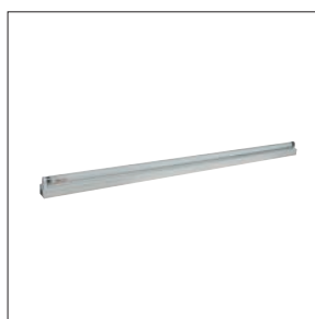
Lampa fluorescenta FIA cu instalatie electrica completa 1x 40W EUR 15.00 Cod 019.010.110.000