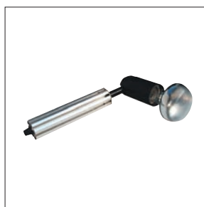
Lampa spot stut OCTANORM EUR 12.00 Cod 019.010.187.000