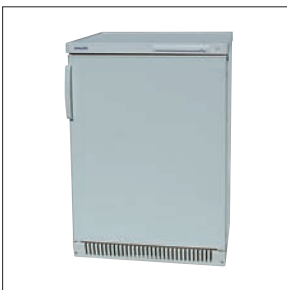
Frigider 125 FB EUR 24.00 Cod 025.010.070.031