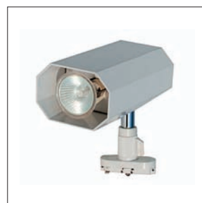
Spot halogen SY STAR 50W(A) EUR 15.00 Cod 019.010.186.000